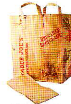
Soiled Paper Bags