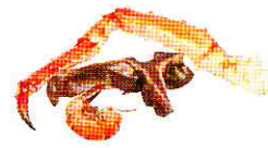
Shellfish & Bones