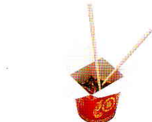
Paper To-Go Boxes