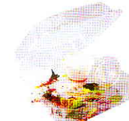
No Plastic To-Go Containers