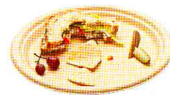
Compostable Plates & Scraps