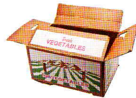
Waxed Produce Boxes