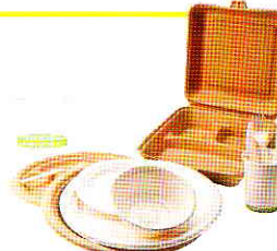
All Compostable Products