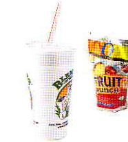
No Styrofoam or Juice Packs