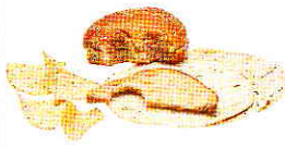
Bread, Tortillas, Chips