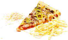
Rice, Pizza, Pasta