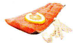
Seafood & Meat